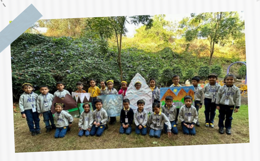
World Mountain Day