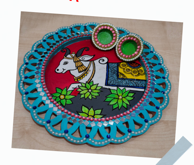
Aarohi Dighe IV A