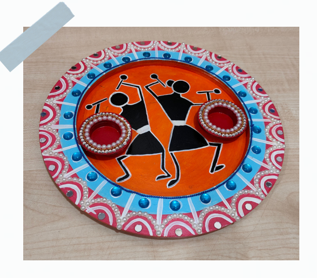
Mughda Gurule IV A