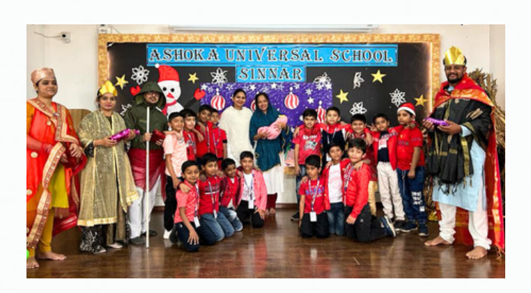
OUR EDUCATORS SHOWCASED WHY CHRISTMAS IS CELEBRATED