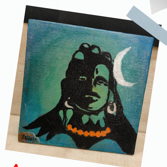
Aarohi Dighe IV A